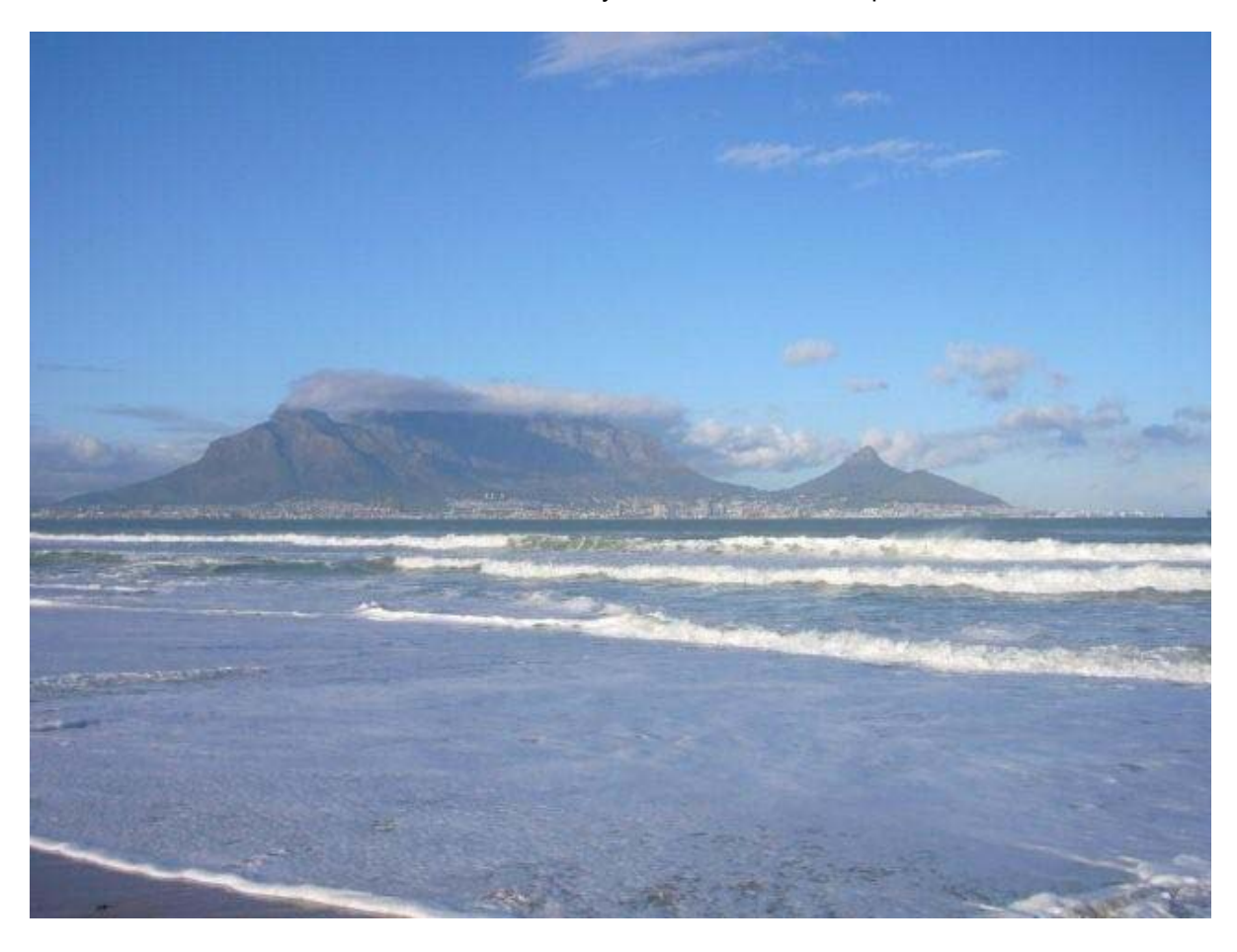
Opposite house: The beach in front of Kitekahunas Beach House with fabulous views on Cape Town and Table Mountain.