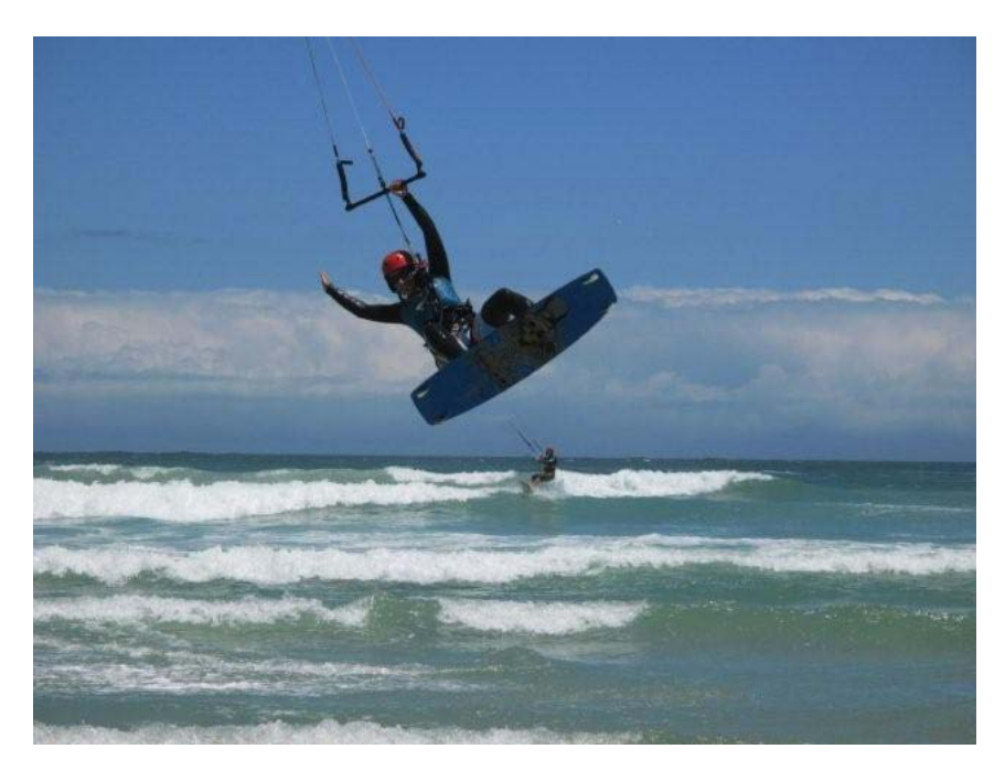
Professional coaching methodologies applied by Kitekahunas require immediate feedback via radio communication.

wrongdoings. Further, you can make use of delayed feedback by means of photos and videos of the student to further fine shape the trick."