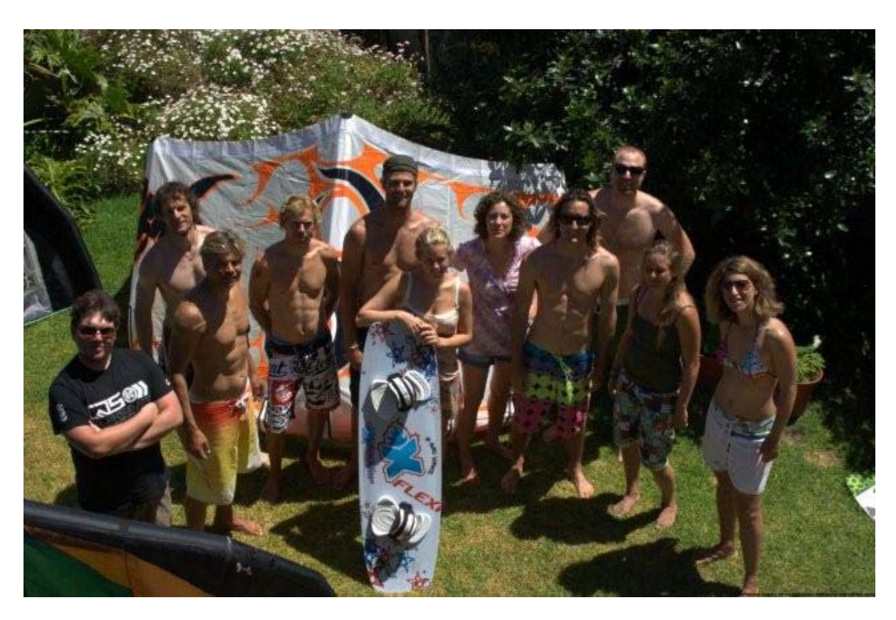
Kitekahunas Team with course participants kitesurfing in Cape Town, South Africa.