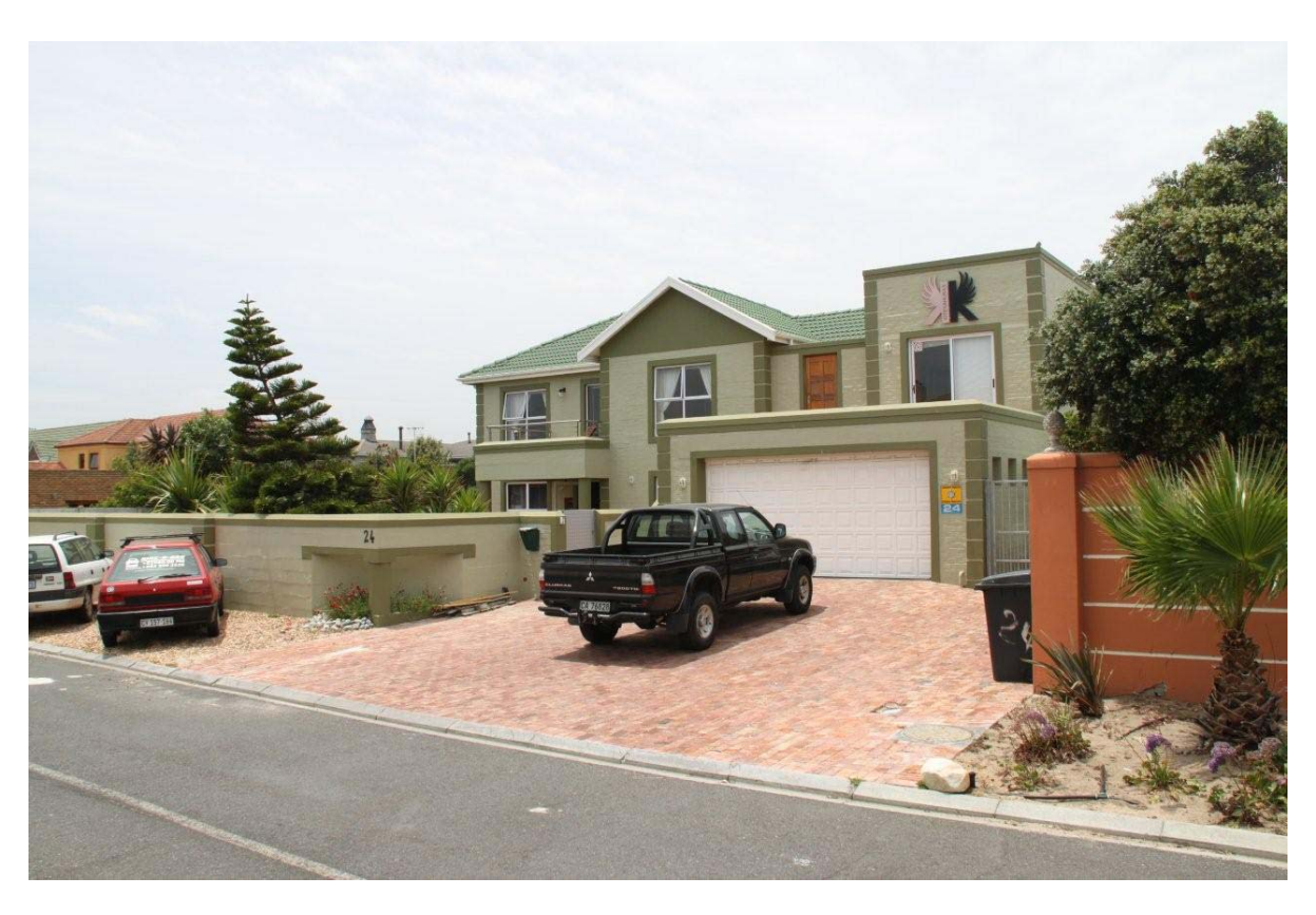
The Beach House of Kitekahunas, located directly on Sunset Beach, Cape Town.